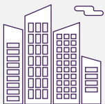
Company Formation & Licensing