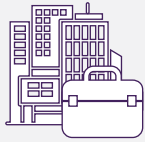
Business Centers & Office Space