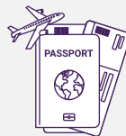
Visa & PRO Services