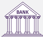
Bank Account Assistance