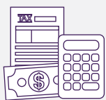
VAT & Tax Consulting