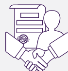
Investor Rights & Protection